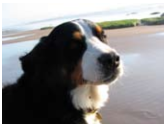
Gherkin on the Oregon coast