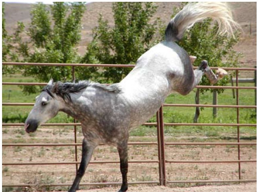
Bergante kickin' up his heels!

Because I had no prior training in this area, it was very likely that I would've done all the wrong things, just from a lack of knowledge to respond effectively when you don't have time to think!