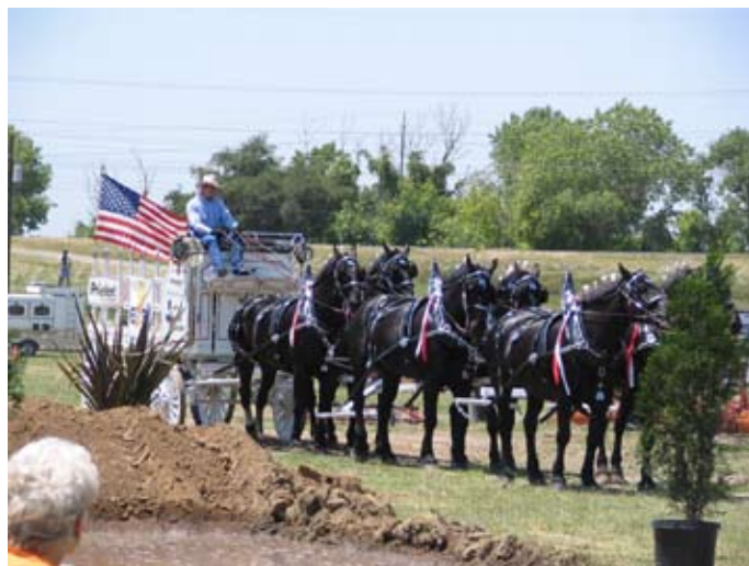
Priefert Percheron Draft Team, Western States Horse Expo, Sacramento, CA