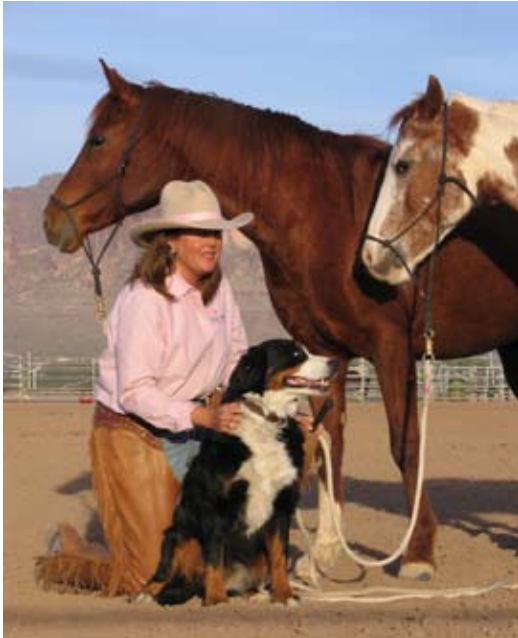
Family photo with Arabesque (Arab-QH) & Rio (Pinto)

“Success is a journey, not a destination.”