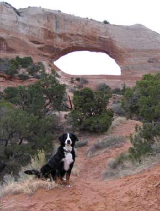
Gherkin at natural arch near Gateway, CO

This is also a great way to share Horsemanship for Women with your friends so they too can get excited about what's possible with their horse!